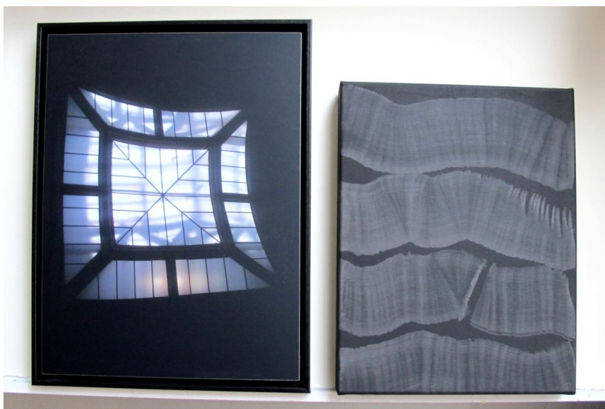
«Venise» Lambda Prints/25, 2010, 30x40cm «Scripture 1» Graphite on canvas, 2011, 26x36cm

Le Jardin de Rodin. - Edition Fischbacher, Paris, 1995 L'Automne Ecorch  Vif - Edition La S t r e, Crest, 1998 A para tre : « La Sorci re de Rati res » Edition Fischbacher, Paris, livre d'art pour enfant « Mondrian et Vermeer, paysages g om triques » Edition Fischbacher, Paris